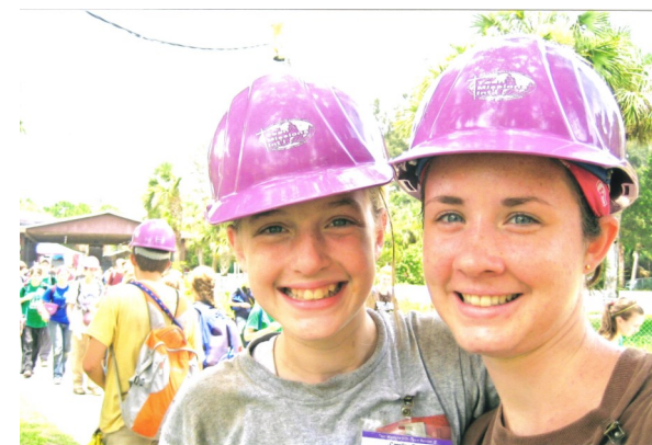
Past Teen Missions Trip